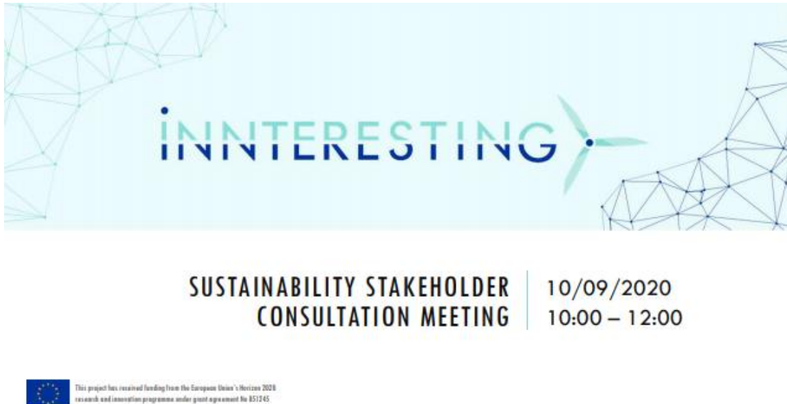
Figure 8 First SAG meeting

On the following day, 10th of September, a sustainability stakeholder consultation meeting was organized for a broader public in an online webinar format. The webinar had more than 30 participants from 20 different European companies.