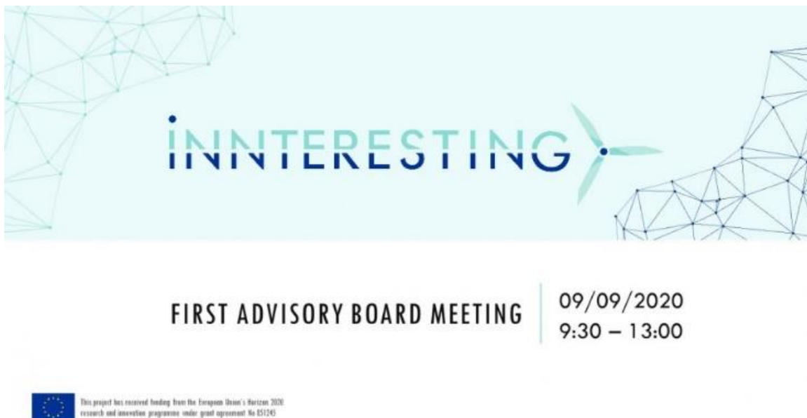
Figure 6 First TAG meeting

The 1st iNINTERESTING Technical Advisory Group meeting took place on the 9th of September and 6 out of the 7 TAG partners participated on it: Vestas, Offshore Renewable Energy Catapult, Siemens Gamesa, General Electric (GE), Iberdrola and Lindo Offshore Renewable Centre (LORC).